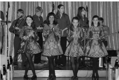
Boyle School Dancers and the Bog Band