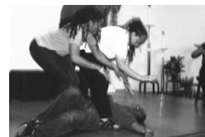
Playback Theater Group performing for the men

For those with season tickets, seeing a professional or college game seems like no big deal but for men who could not possibly afford a ticket, it is a mighty big treat.