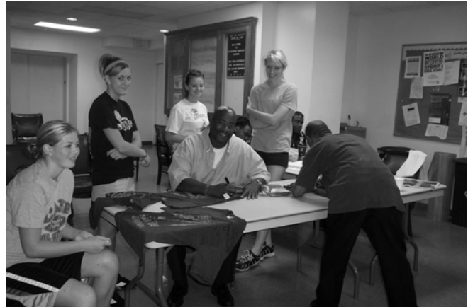
Student Group from Nebraska participates in activities at the Center

We envision a new building in the immediate area specific to our needs, that has a dedicated commercial kitchen, office space, meeting rooms, laundry and shower facilities as well as supportive single room occupancy housing for up to forty-eight men. Also, an expanded food pantry for those in need., allowing greater choice and the ability to shop with dignity.