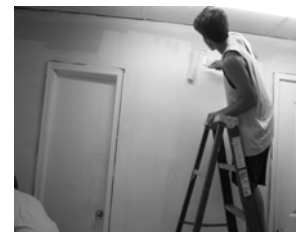
Gonzaga Freshman helping to Beautify the place.

On August 10, we will have our last baseball outing of the season. We will be taking a group of homeless men to Baltimore to see the Orioles. We will continue to see games next year, God willing, in Baltimore.